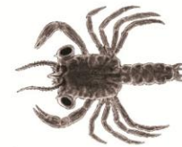
Crab Megalops Larva