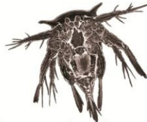
Barnacle Nauplius Larva