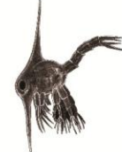
Crab Zoea Larva