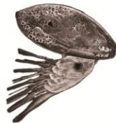
Barnacle Cyprid Larva